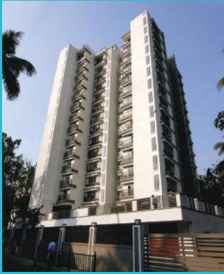
Vijayashree - Chembur