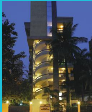
Sethna Manor - Chembur