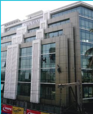
The Central - Chembur