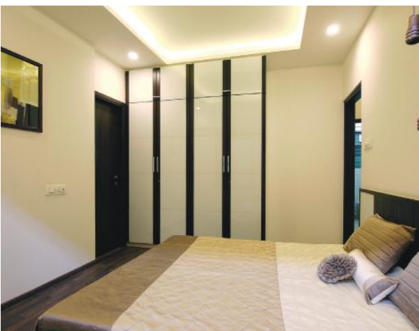
Actual images of the sample flat